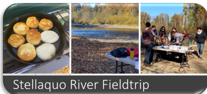
Stellaquo River Fieldtrip

The school community of EBUS Academy spent the fall participating in numerous learning activities that truly demonstrate the goal of Honouring Diversity. Students and families were able to spend a day by the Stellaquo River on beautiful Stellat'en territory to learn about spawning Sockeye salmon, cooking Bannock, nature, and of course, one another! Students and families have also been able to visit Stanley Park this fall to explore the impacts of events on the people living in the Territories of the Squamish, Musqueam and Tsleil-Waututh Nations.