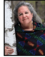
Robin Wall Kimmerer